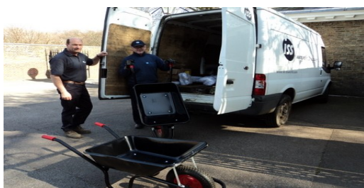
ISS donating wheelbarrows

We were delighted when the CEO of ISS Landscapes approached us proposing that Gardening Leave become their charity partner and their first collaboration with Gardening Leave at the Royal Hospital site has been an unqualified success. We are looking forward to our two organisations working together throughout the UK in the future!