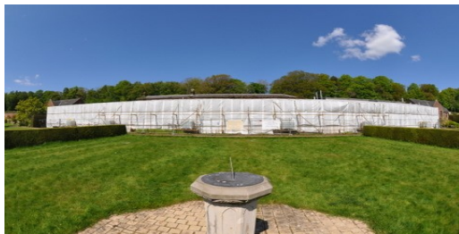
Repair of the stonework & replacement of the wood is progressing well. Next stage, re-glazing!