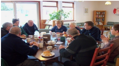
Gardening Leave Staff, volunteers & veterans enjoy a chat during tea break.