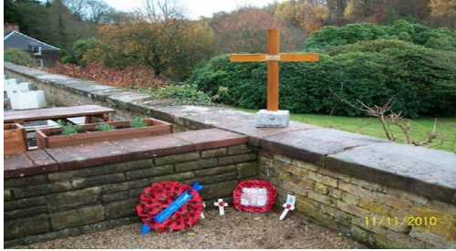
“We will remember them” Remembrance