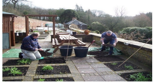
Veterans working on the Poppy beds, getting ready for the new season.