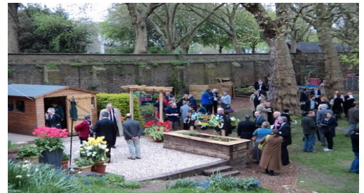
Guests at the Official Opening of Gardening Leave Chelsea 14th April 2011.